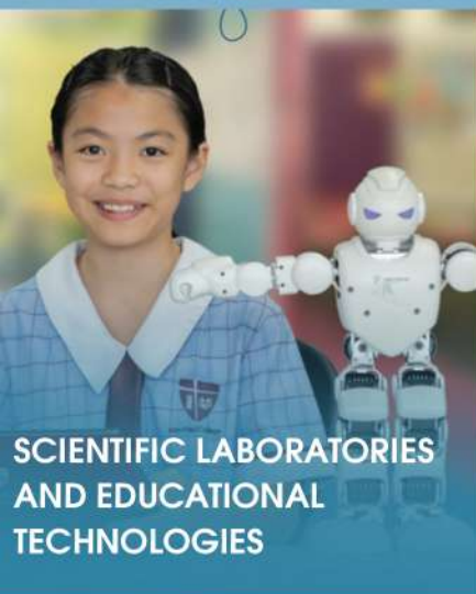
SCIENTIFIC LABORATORIES AND EDUCATIONAL TECHNOLOGIES