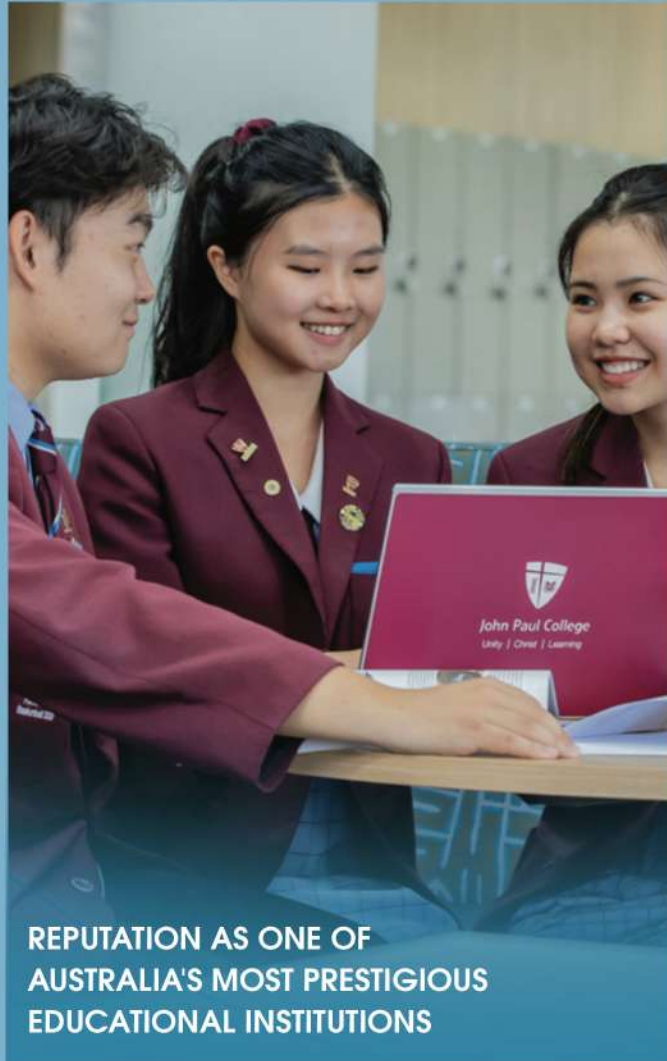
REPUTATION AS ONE OF AUSTRALIA'S MOST PRESTIGIOUS EDUCATIONAL INSTITUTIONS