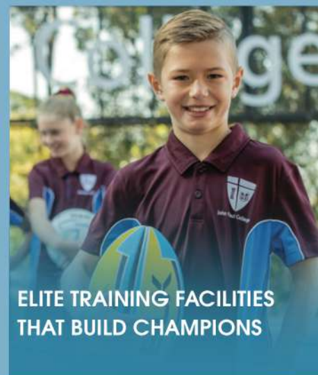
ELITE TRAINING FACILITIES THAT BUILD CHAMPIONS