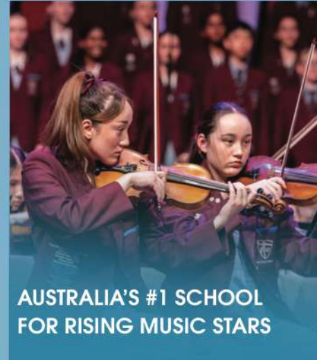
AUSTRALIA'S #1 SCHOOL FOR RISING MUSIC STARS